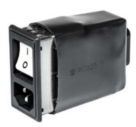
RC320 Rear Cover for Power Entry Module